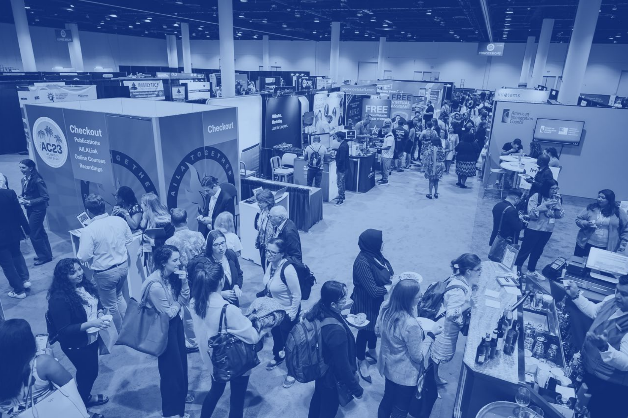
2024 AILA ANNUAL CONFERENCE ON IMMIGRATION LAW EXHIBIT AND SPONSORSHIP PROSPECTUS