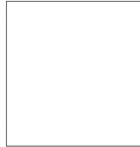
Right index fingerprint of alien removed

(Signature of alien being fingerprinted)