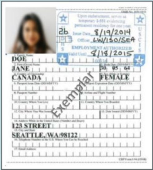
Example Form I-94 with Photo (ADIT stamp in-person)