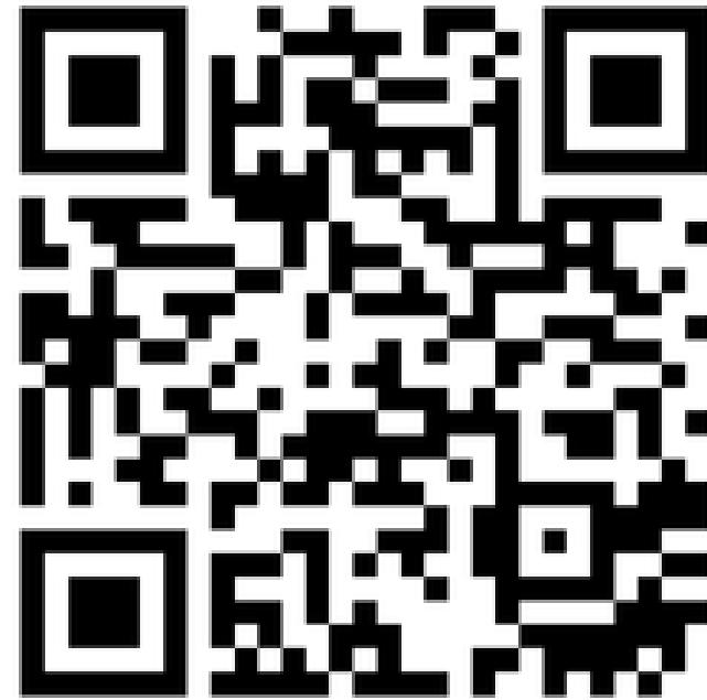
AILA Rundown Newsletter